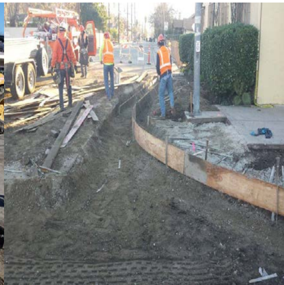
Forming for Concrete Pour